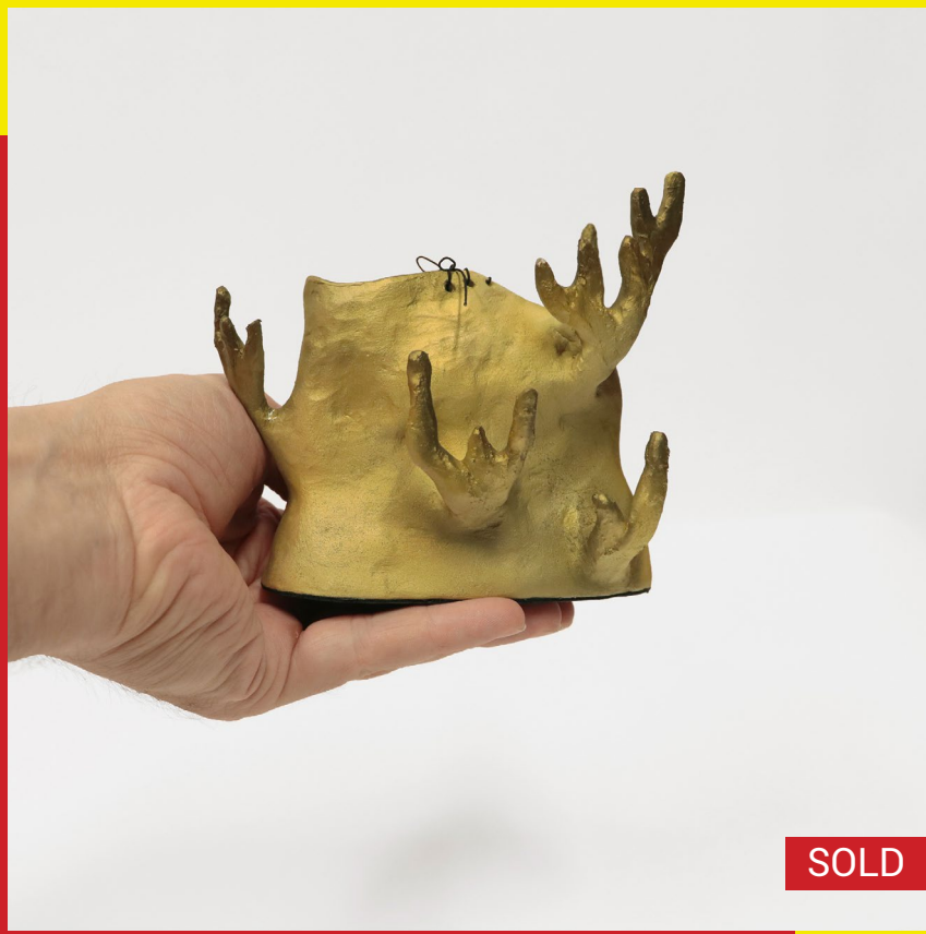
Mini UPO (buck moon) 2023, Polymer clay, airbrush paint, varnish, elastic laces, 15x15x6cm. £250 (unique piece)