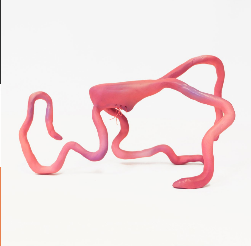
Mini UPO (L1) 2023, Epoxy clay, airbrush paint, varnish, elastic laces, 15x25x12cm. £300 (unique piece)