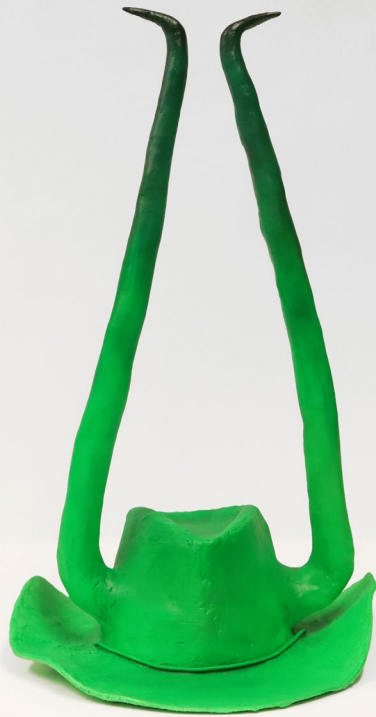
UPO (cornillato) - H 2023, Cowboy hat, hybrid polymer, aluminium, airbrush paint, 60x40x35cm. £1300 (unique piece)