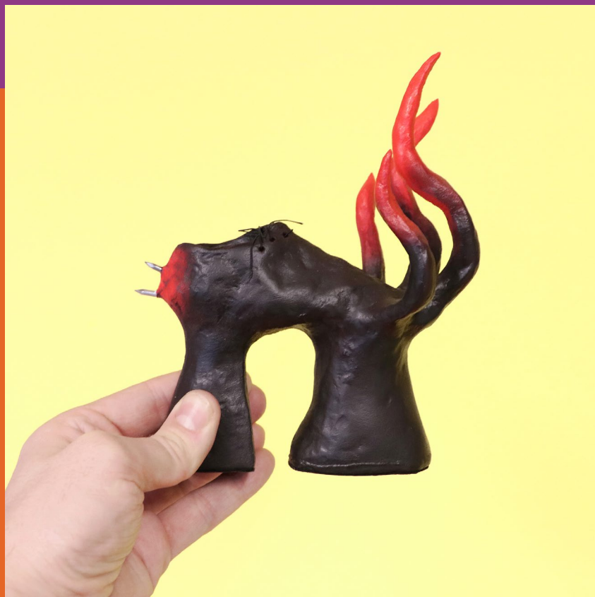
Mini UPO (cornillano) 2023, Polymer clay, airbrush paint, varnish, elastic laces, 18x15x12cm. £300 (edition 3 of 3)