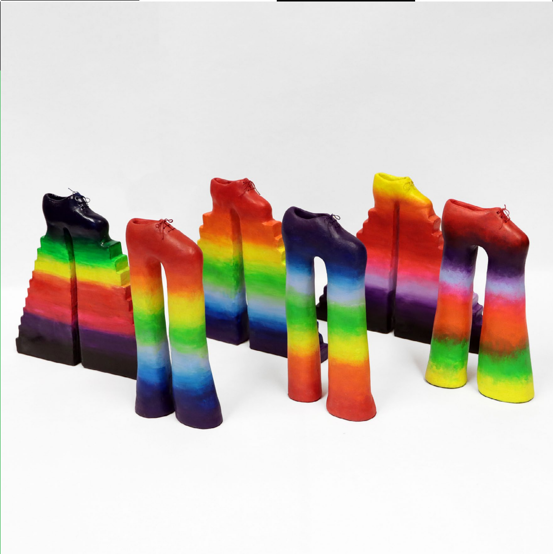
Mini UPOs (C0036) 2022, Polymer clay, acrylic paint, varnish, elastic laces, 20x10x3cm & 20x20x3cm. £250 each, £450 per couple (unique pieces)