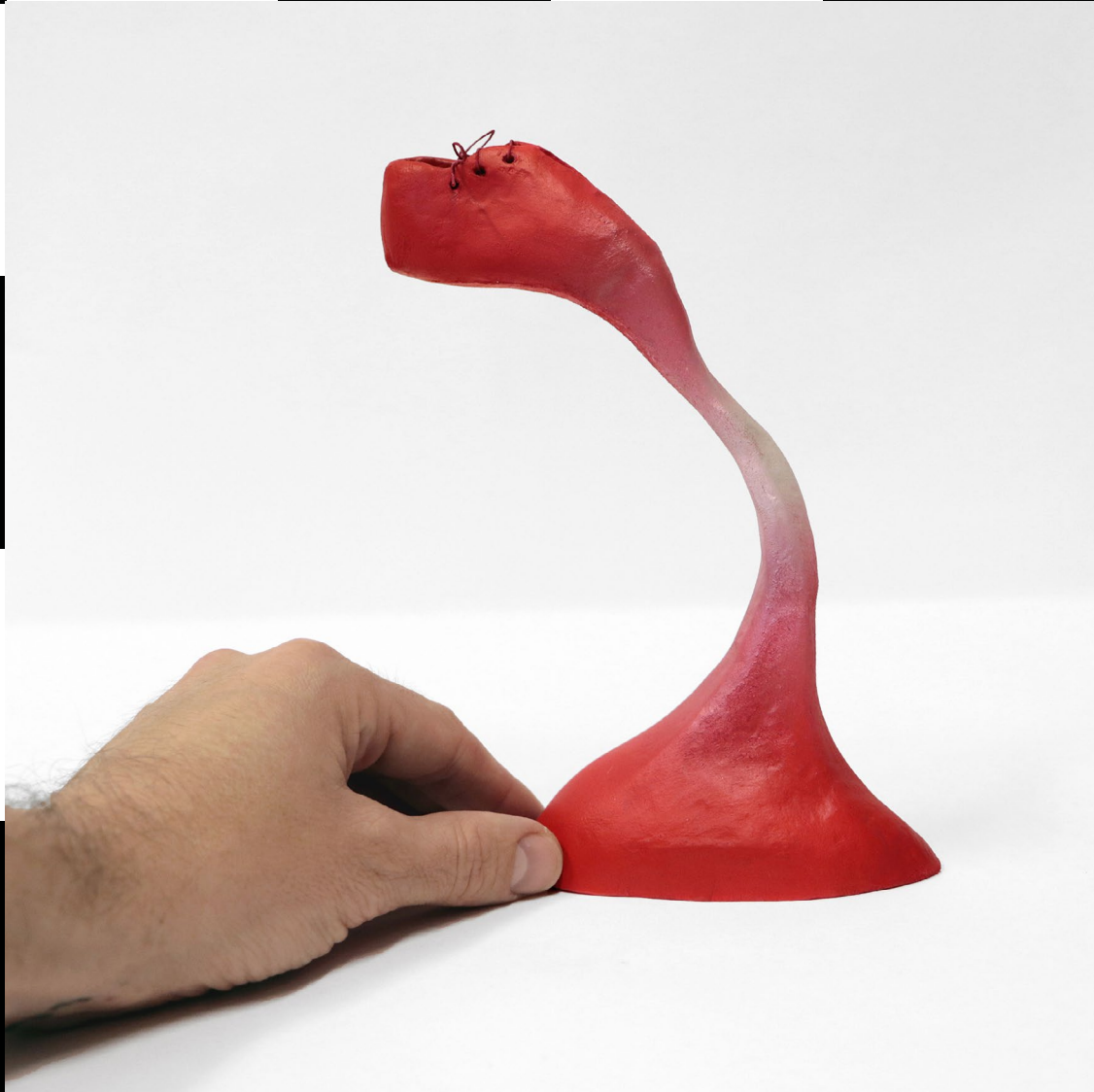
Mini UPO (F1) 2023, Polymer clay, airbrush paint, varnish, elastic laces, 20x15x6cm. £300 (unique piece)