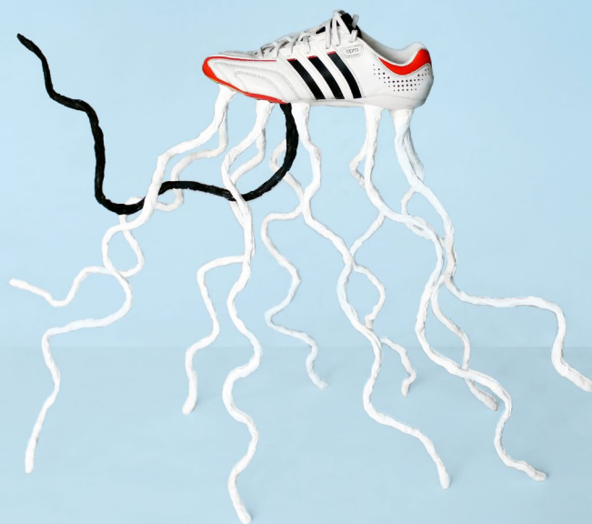
UPO (a tredici che poi sono undici) 2020, Adidas 11 pro, hybrid polymer, aluminium, acrylic paint, 60x70x60cm. £1600 (unique piece)