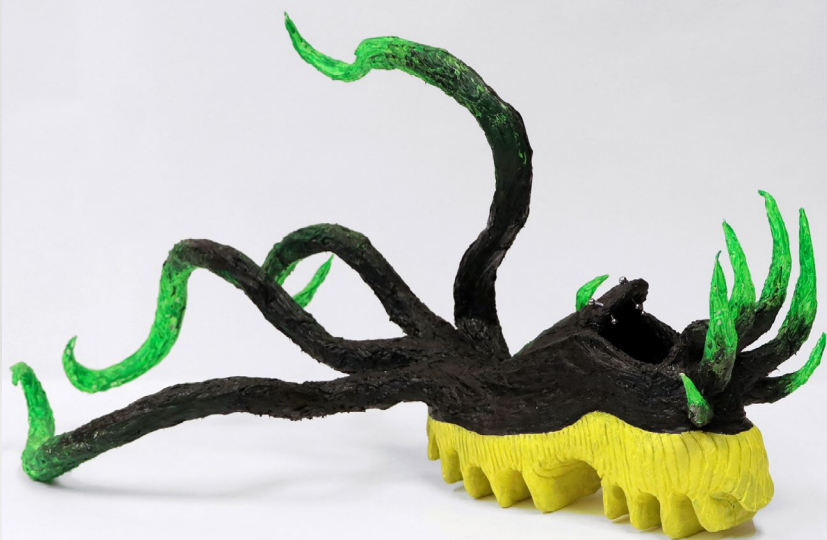
UPO (DR) 2021, Counterfeit Nike TN Air Max Plus, hybrid polymer, polymer clay, plastics, aluminium, piercings, 65x40x35cm. £1300 (unique piece)