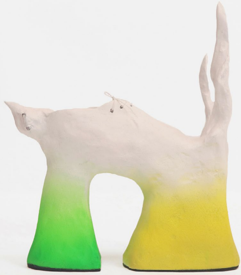
Mini UPO (krishnasaar) 2023, Polymer clay, airbrush paint, varnish, elastic laces, 16x15x4cm. £280 (edition 2 of 3)