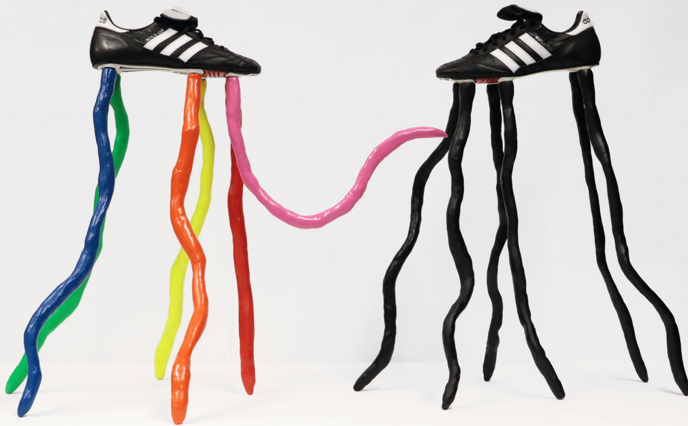
UPO (corri ragazz* corri) 2020, Adidas world cup, epoxy clay, aluminium, spray paint, 60x70x50cm & 60x50x40cm. £1600 each, £3000 per couple (unique piece)