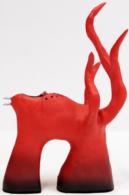
Mini UPO (cornillaro) 2023, Polymer clay, airbrush paint, varnish, elastic laces, 22x15x12cm. £300 (unique piece)