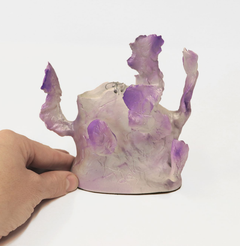
Mini UPO (floral moon) 2023, Polymer clay, airbrush paint, varnish, elastic laces, 15x15x8cm. £250 (unique piece)