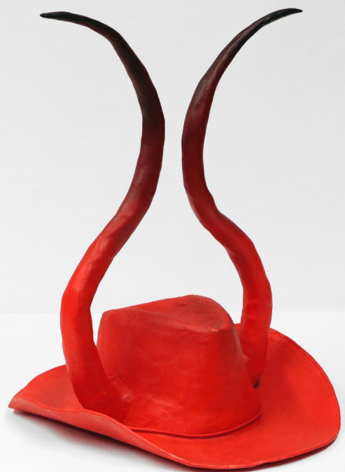
UPO (cornillaro) - H 2023, Cowboy hat, hybrid polymer, aluminium, airbrush paint, 50x40x35cm. £1300 (unique piece)