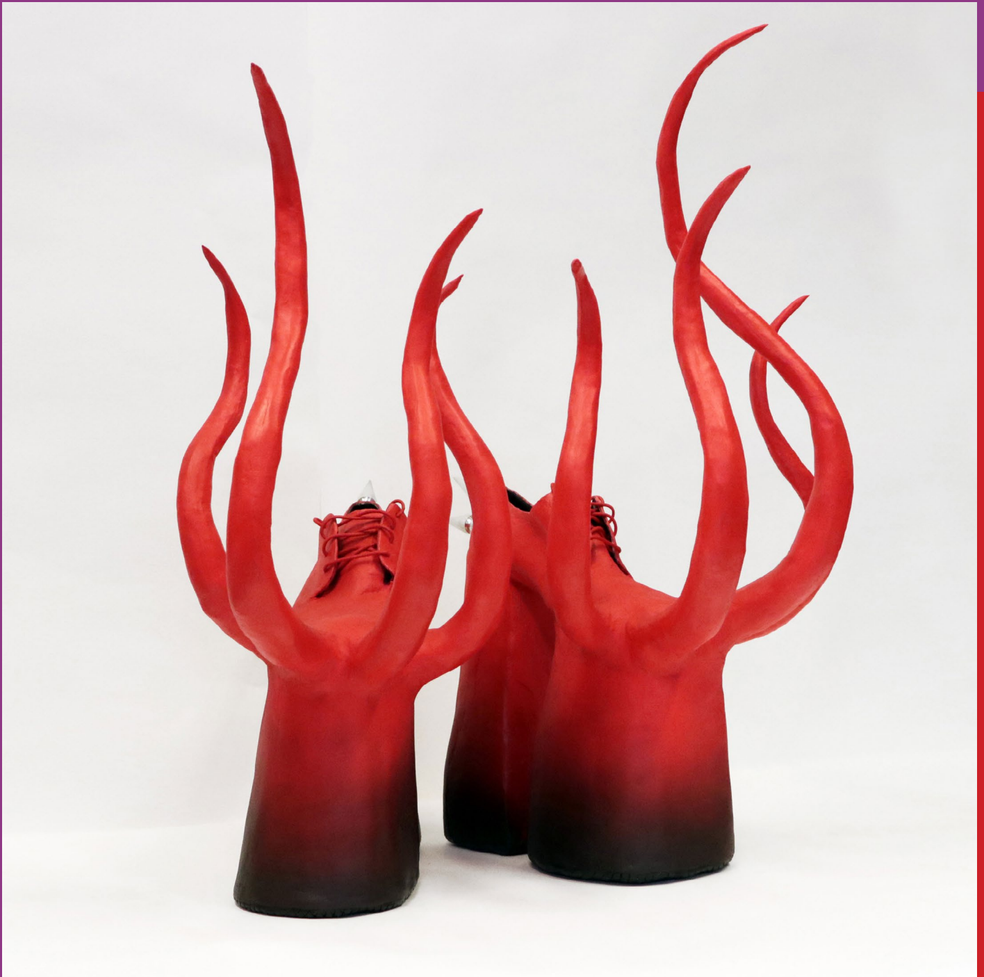
UPO (cornillaro) - S 2023, 80's platform boots, hybrid polymer, aluminium, airbrush paint, 70x55x35cm each. £3300 per couple (unique piece)