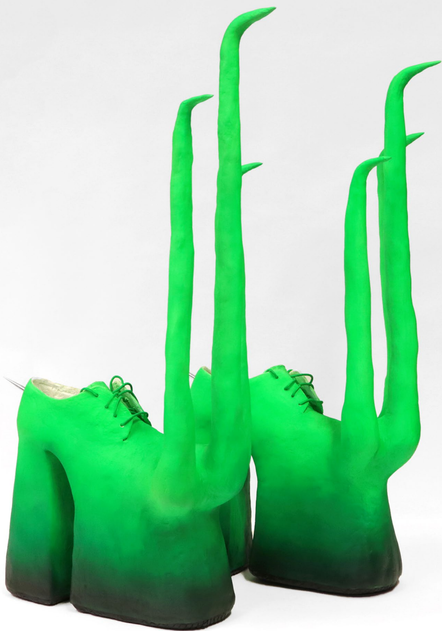
UPO (cornillato) - S 2023, 70's platform boots, hybrid polymer, aluminium, airbrush paint, 80x35x20cm each. £3300 per couple (unique piece)