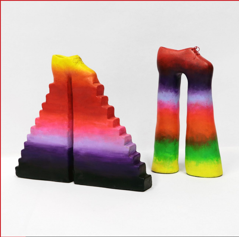
Mini UPOs (C0036) 2022, Polymer clay, acrylic paint, varnish, elastic laces, £250 each, £450 per couple (unique pieces)